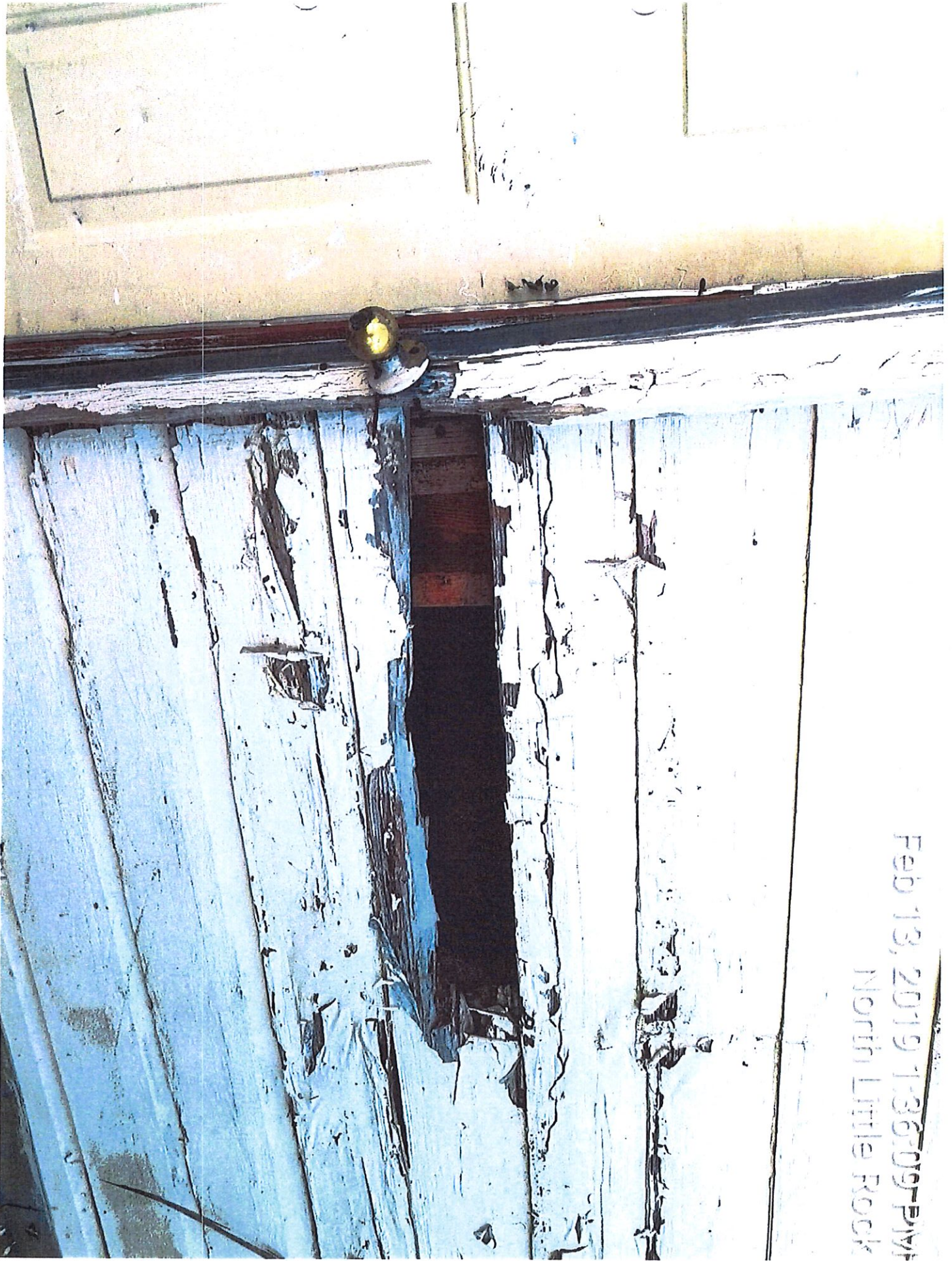
Feb 13, 2019 1:36:09 PM North Little Rock