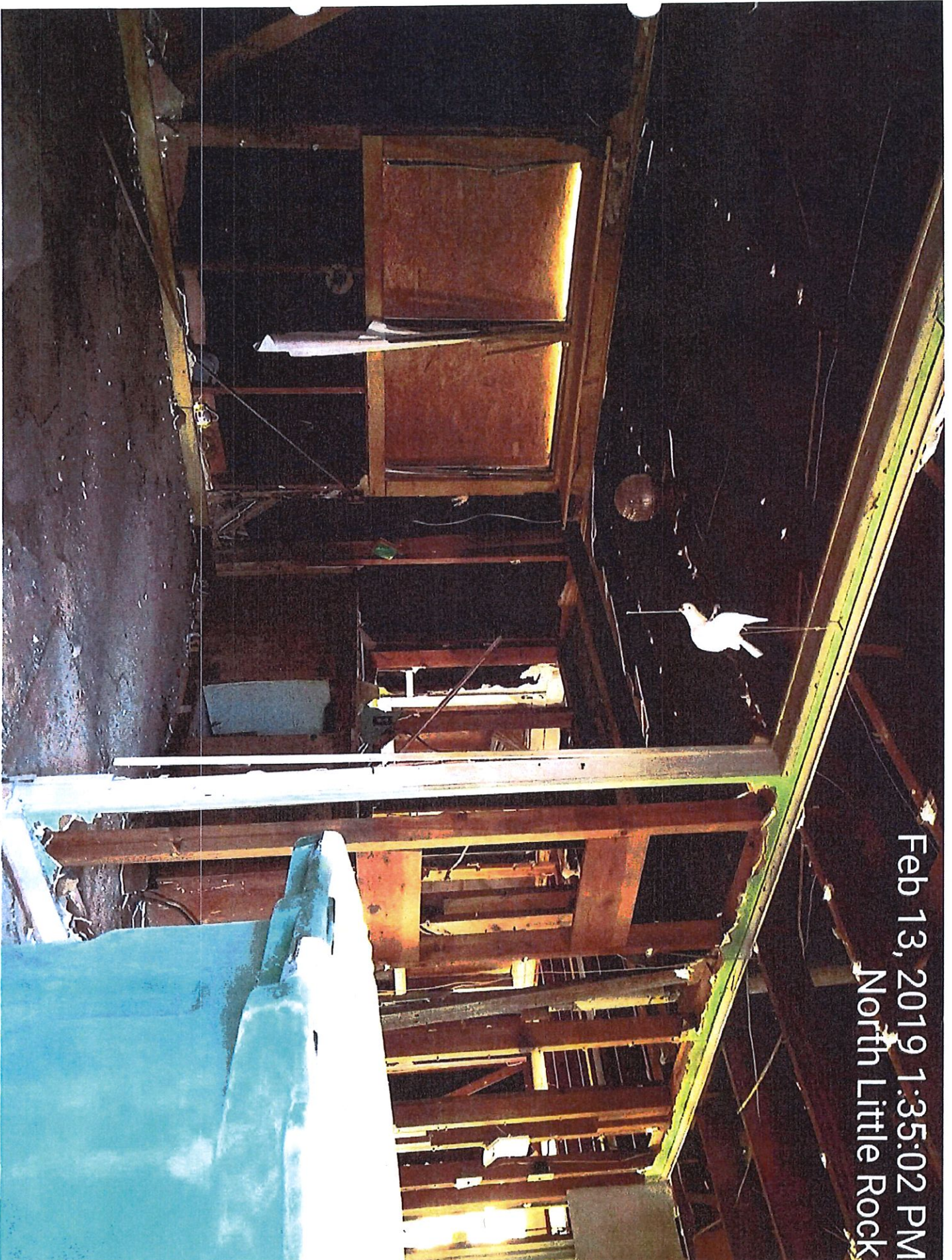
Feb 13, 2019 1:35:02 PM North Little Rock