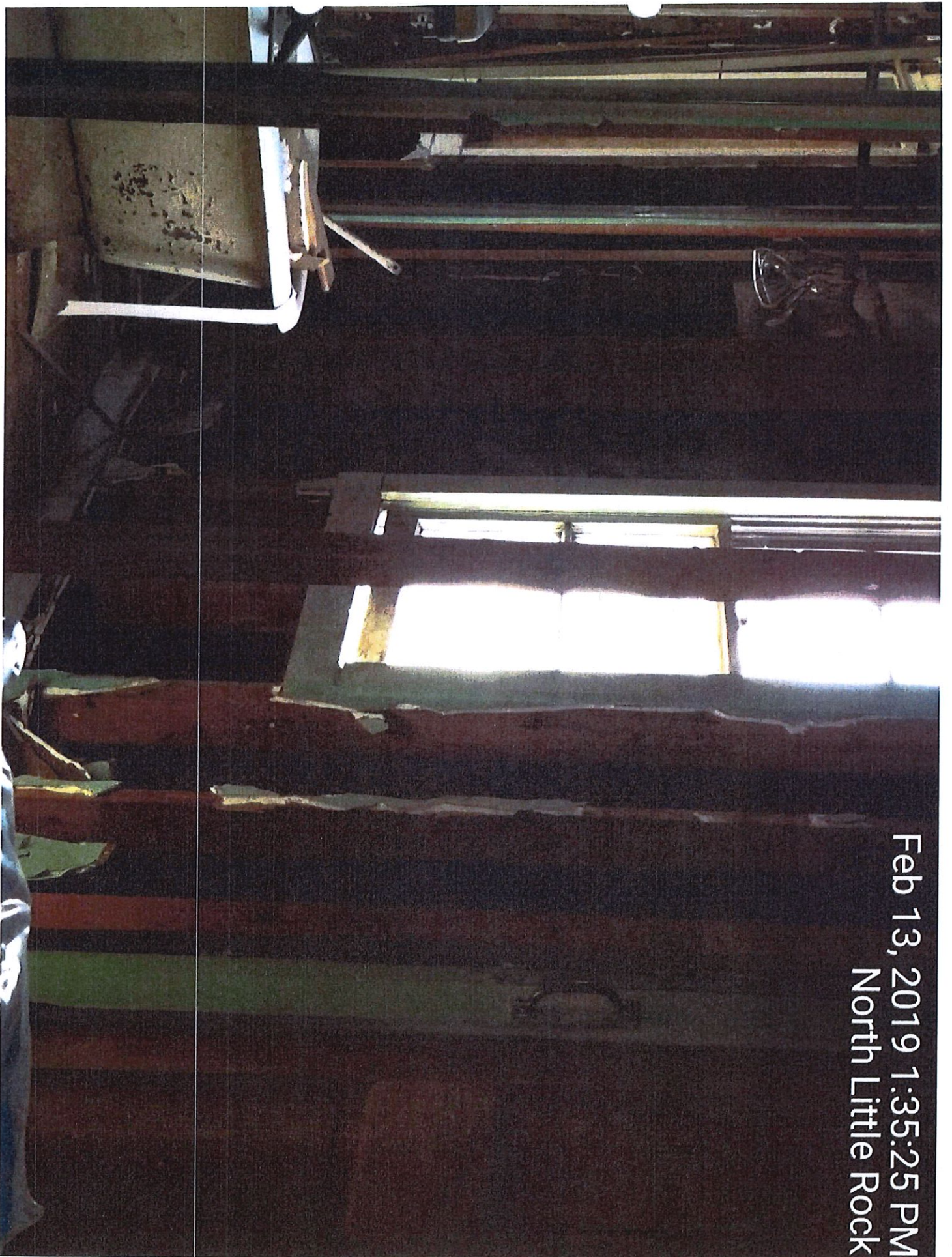
Feb 13, 2019 1:35:25 PM North Little Rock