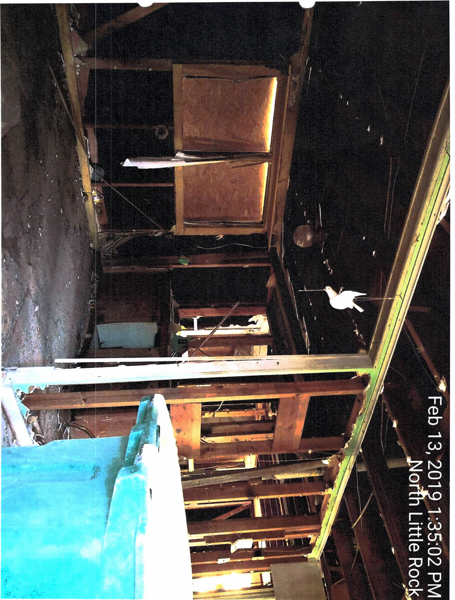
Feb 13, 2019 1:35:02 PM North Little Rock