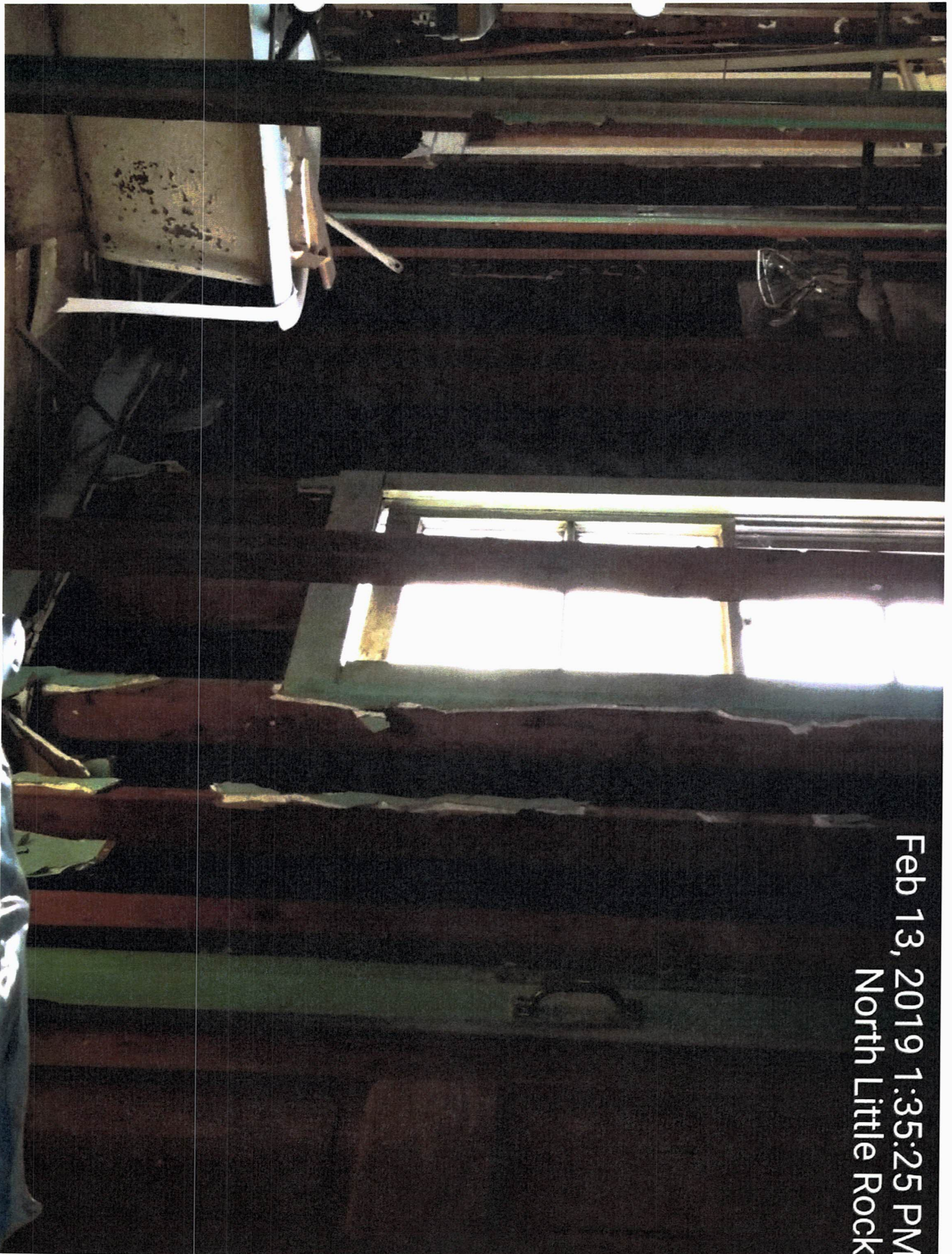
Feb 13, 2019 1:35:25 PM North Little Rock